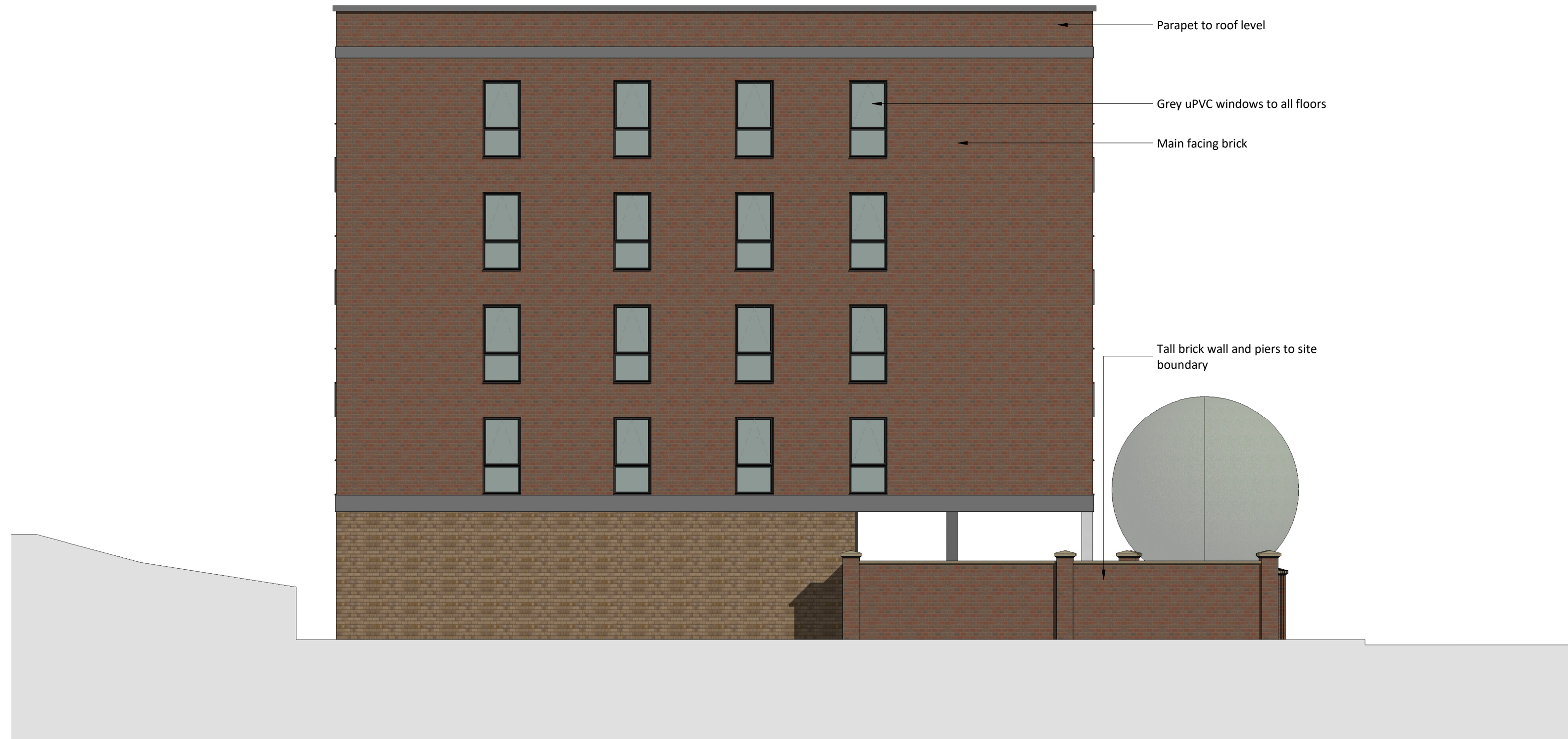
East Elevation (Gable) 1 : 100